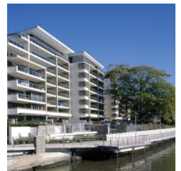
Riverfront - Cutters Landing, QLD