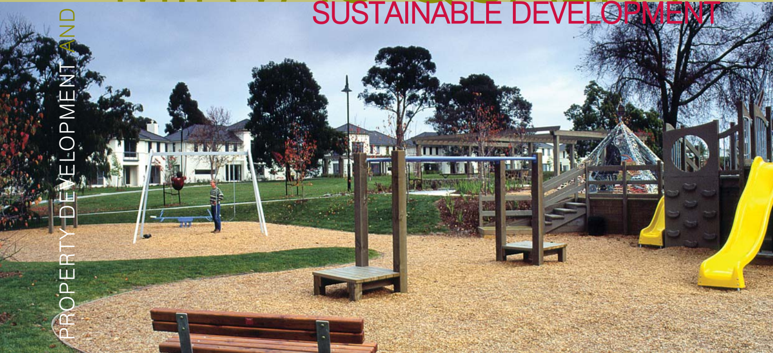
The Heath - Victoria