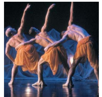
Cultural - Walsh Bay, NSW