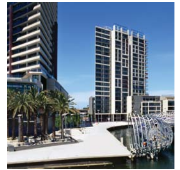
Public Art - Yarra's Edge, VIC