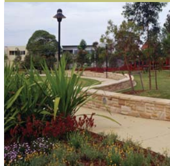
Living verges - native, drought resistant landscape