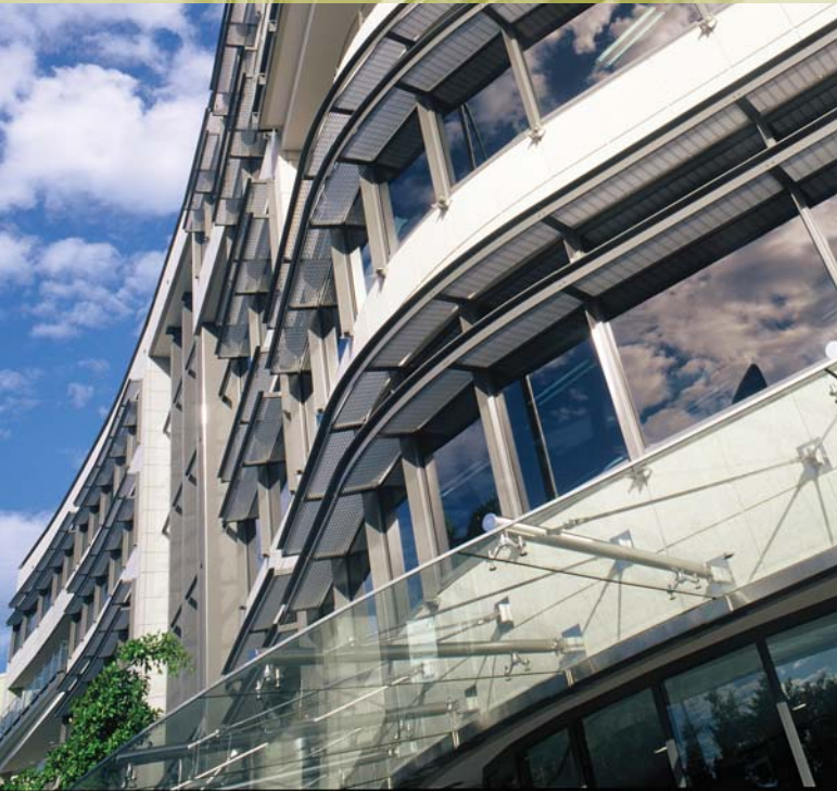
Bay Centre, Pyrmont: A 15,000m 2 A-grade commercial building with 4 star ABGR, designed, developed and owned by Mirvac, completed in 2002

Mirvac's extensive integrated in-house property expertise allows it to address sustainability from the 'cradle to the grave'. The design and development approach to new office buildings is to integrate energy efficient design principles at the earliest stages of planning and allows