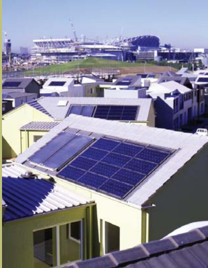
Solar Energy, Newington