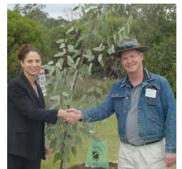
Tree Planting - Bridgewater, WA