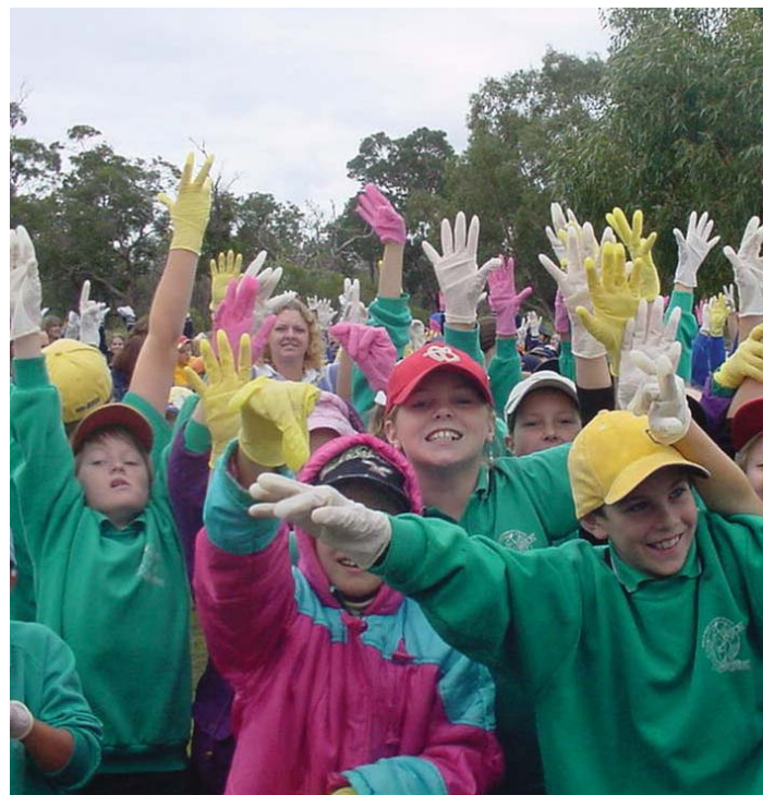
Hands in the Air, Planting Day WA - Sponsored by Mirvac Fini