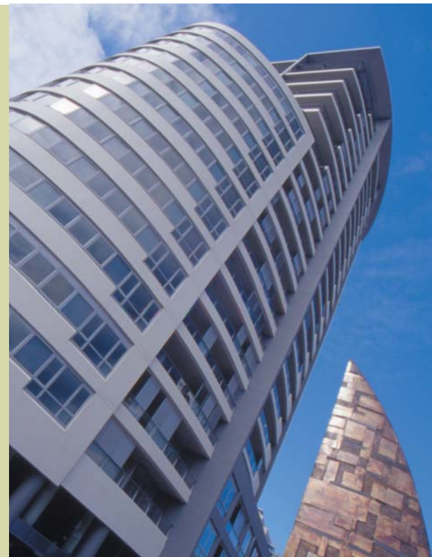
Altura, Pacific Place Chatswood