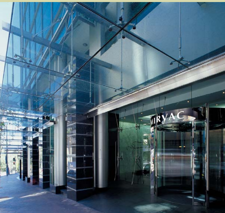
40 Miller St, North Sydney: 12,500m 2 A-grade commercial building with 4 star ABGR, designed, developed and owned by Mirvac, completed in 2000