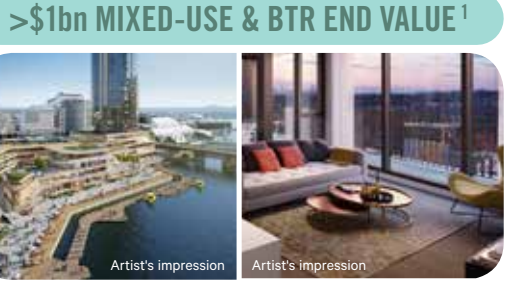
Walker St & Pacific Hwy, North Sydney

Secured interests amounting to 25% of unit entitlements in two North Sydney office towers in 1H19.