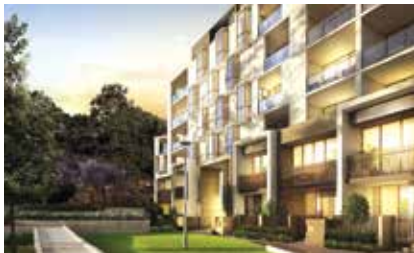
ARTIST IMPRESSION OF HAROLD PARK, SYDNEY, NSW