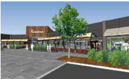
ARTIST IMPRESSION OF KAWANA SHOPPINGWORLD, QLD