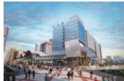
ARTIST IMPRESSION OF 699 BOURKE STREET, MELBOURNE, VIC