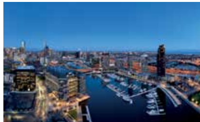
ARTIST IMPRESSION OF YARRA'S EDGE, YARRA POINT, VIC