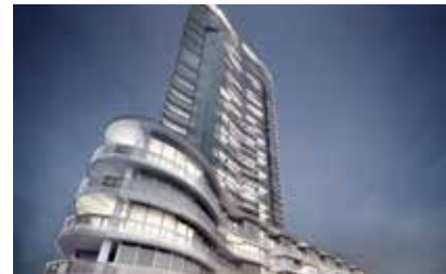
ARTIST IMPRESSION OF YARRA'S EDGE, ARRAY, VIC