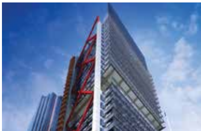
ARTIST IMPRESSION OF 8 CHIFLEY SQUARE, SYDNEY, NSW