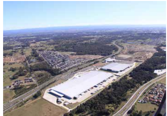
HOXTON DISTRIBUTION PARK, HOXTON PARK, NSW