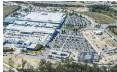
ORION SPRINGFIELD, QLD