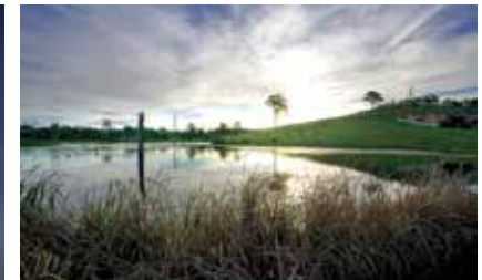
ELIZABETH HILLS, SYDNEY, NSW