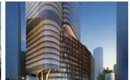
ARTIST IMPRESSION OF 200 GEORGE STREET, SYDNEY, NSW

Mirvac's integrated model delivering results for office