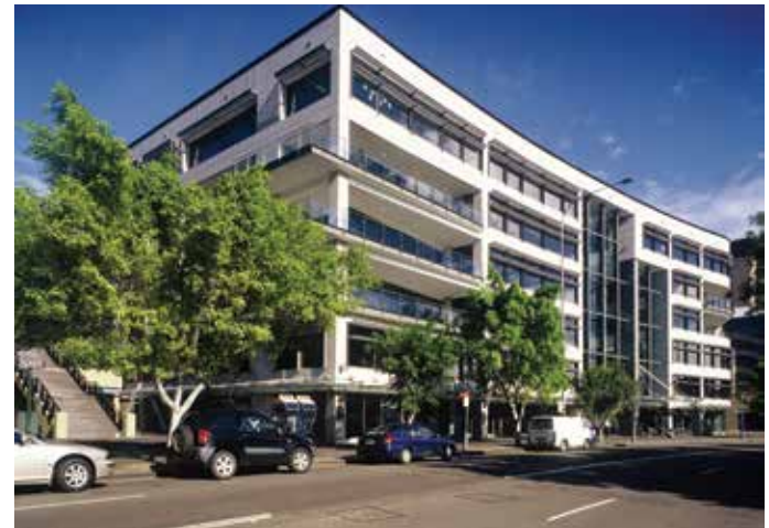
BAY CENTRE, PYRMONT, NSW