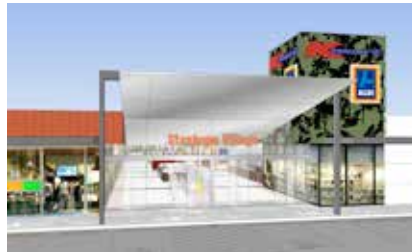
ARTIST IMPRESSION OF STANHOPE VILLAGE, NSW