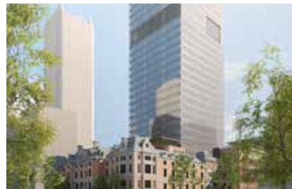
ARTIST IMPRESSION OF TREASURY BUILDING, PERTH, WA