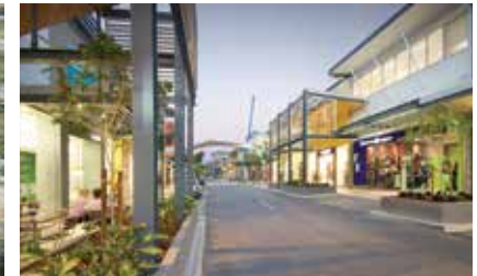
ARTIST IMPRESSION OF ORION SPRINGFIELD, QLD