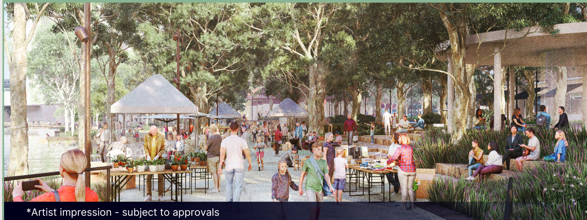
*Artist impression - subject to approvals