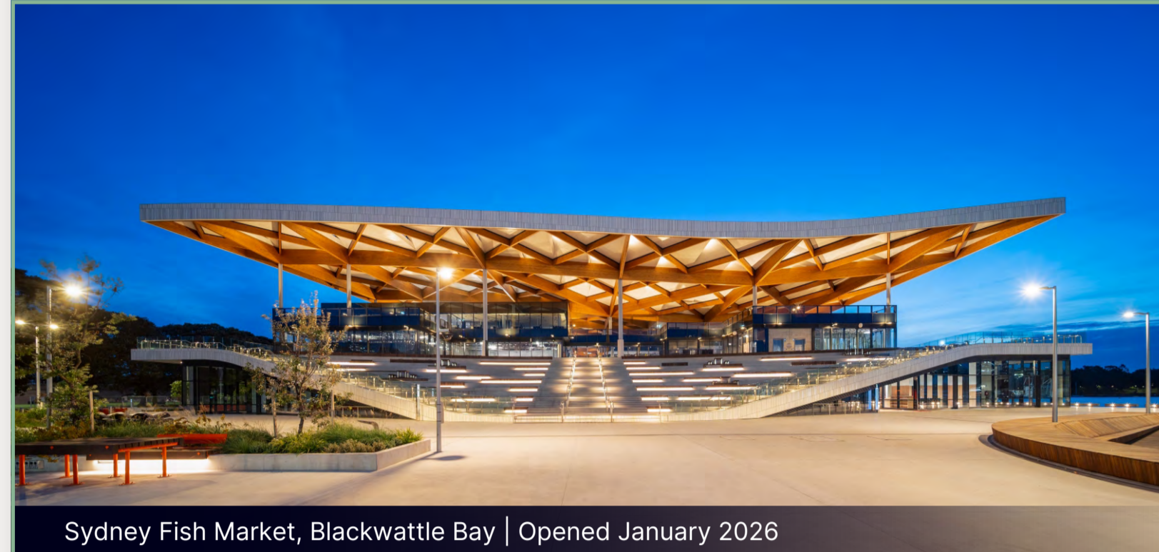
Sydney Fish Market, Blackwattle Bay | Opened January 2026