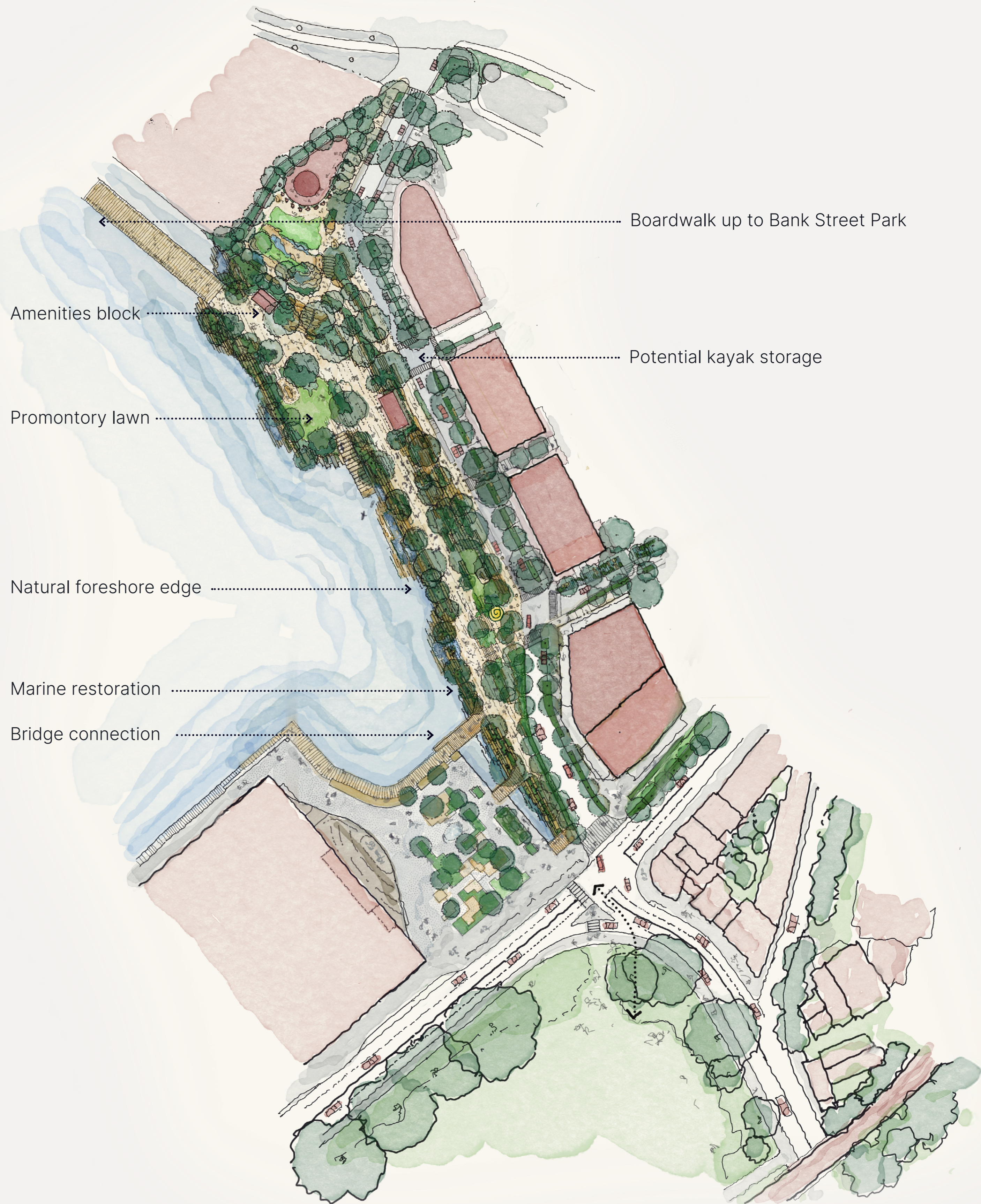
Proposed foreshore promenade

We propose to deliver a 26,000 square metre public domain, with an ambition to create an 'outdoor living room' for the community.