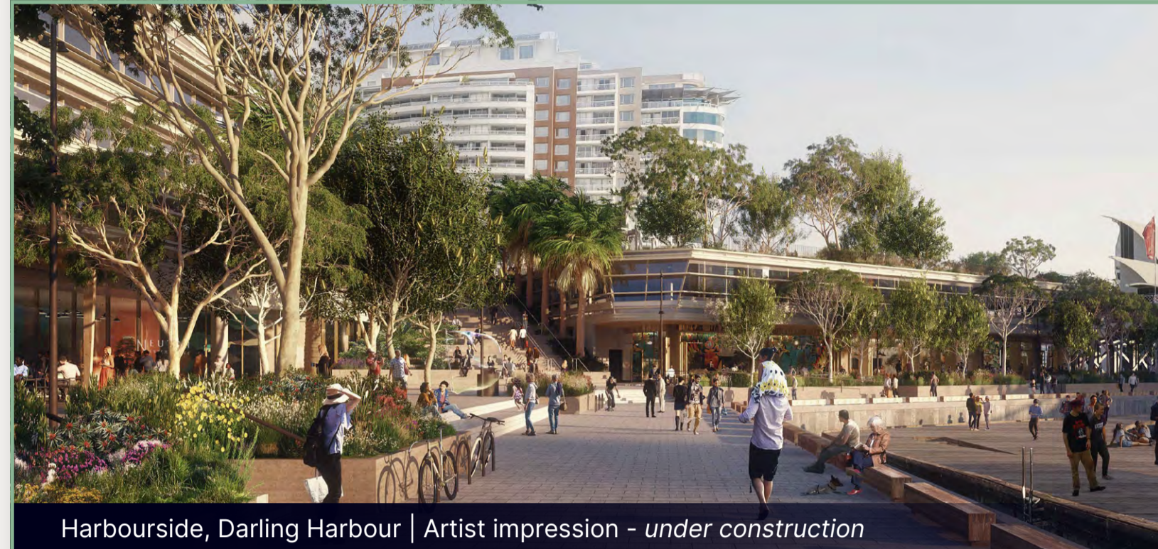
Harbourside, Darling Harbour | Artist impression - under construction