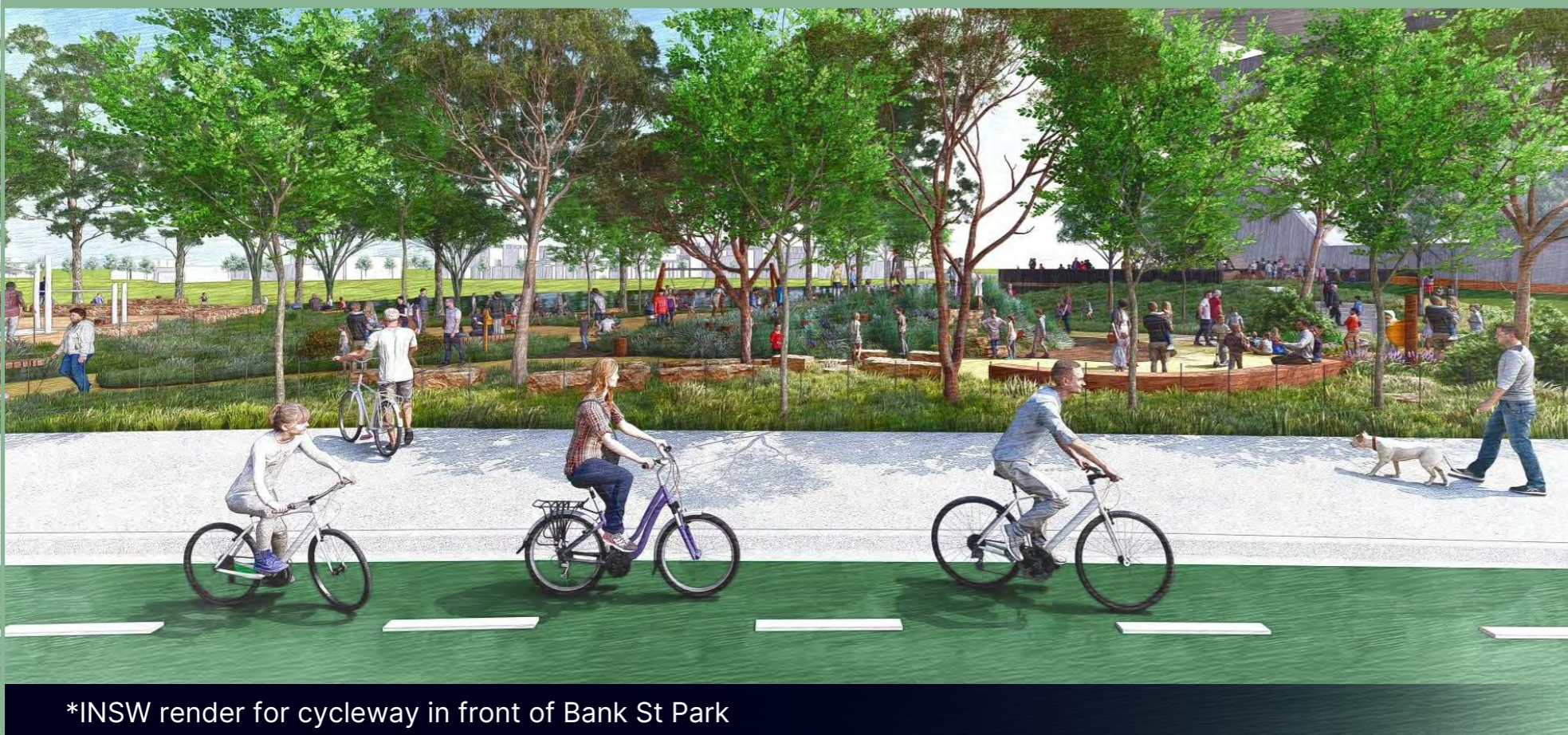
*INSW render for cycleway in front of Bank St Park